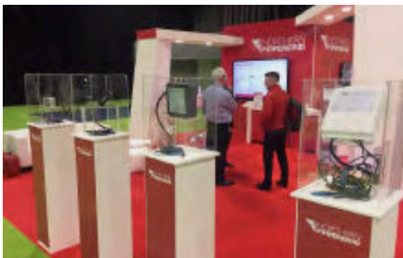
LCNI conference 2019

As part of the development process, several iterations of prototype Guards were produced, building up the learning on what the requirements for a device for widescale deployment should be. The various evolutions of the Guard device formed part of the Northern Powergrid exhibition stand at the LCNI conference in 2019.