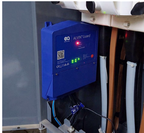
ALVIN® Guard installation