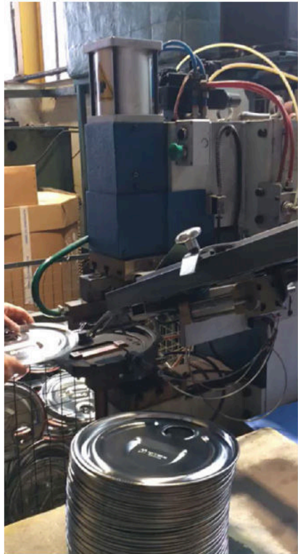
Figure 2: A spot welding machine used to weld handles on to metal lids.

The VisNet® Hub will provide LV network operators the visibility required to manage and understand situations like these. If you would like to know more about the VisNet® Hub and its many capabilities, please click here .