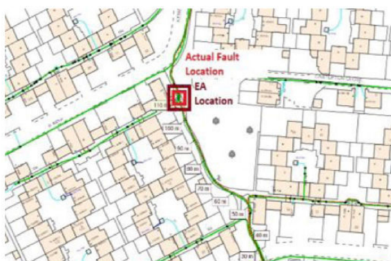
An example of predicted and measured fault location.

EA Technology have developed the VisNet® Hub monitoring platform, which provides measurements and insights into LV distribution systems. The VisNet® hardware is complemented by a software package, enabling network operators to visualise and manage their LV networks in real-time. Alarms, historical data, and the dynamic status of equipment for the entire LV network can be managed from one web application.